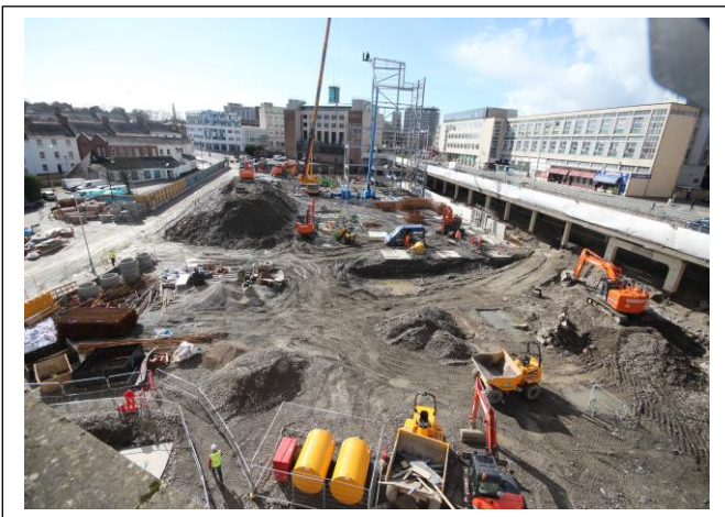
View from the Gala Bingo