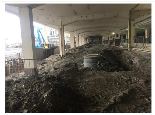
Drainage diversion completed to undercroft.