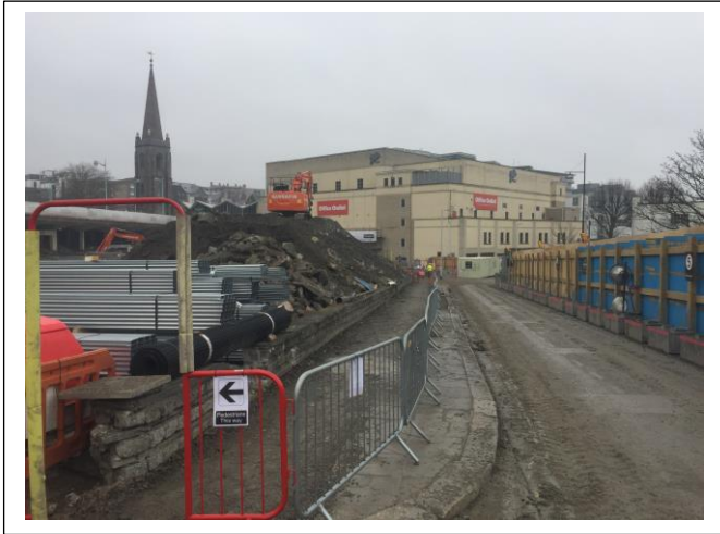
Initial services diversion completed on Bretonside.