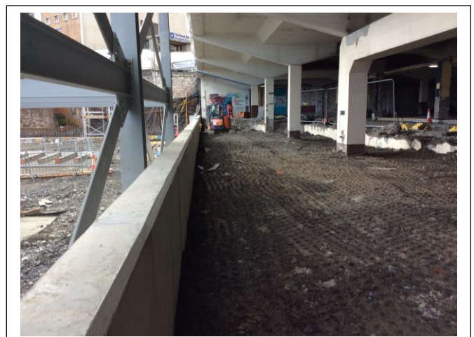
Infilling rear of viaduct retaining wall progressing.