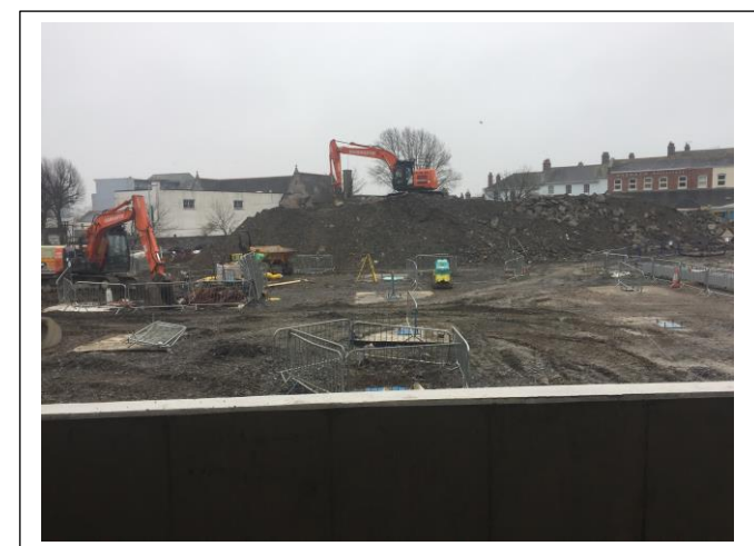
Preparation of Zone 2 for steelwork installation.

Works programmed for the next week include: