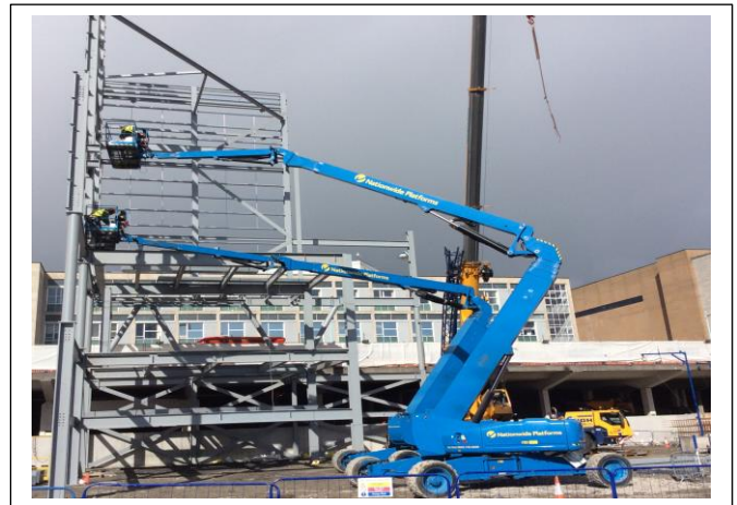
Structural steelwork installation ongoing.