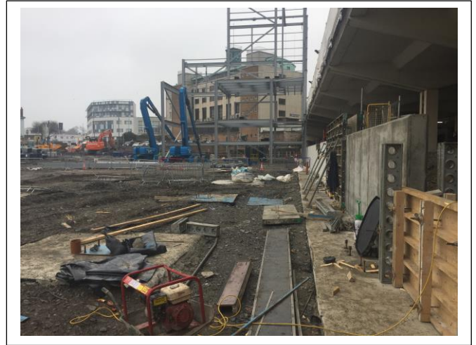
Preparation work ongoing to the retaining wall along the viaduct.